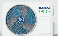
Outdoor unit KEX